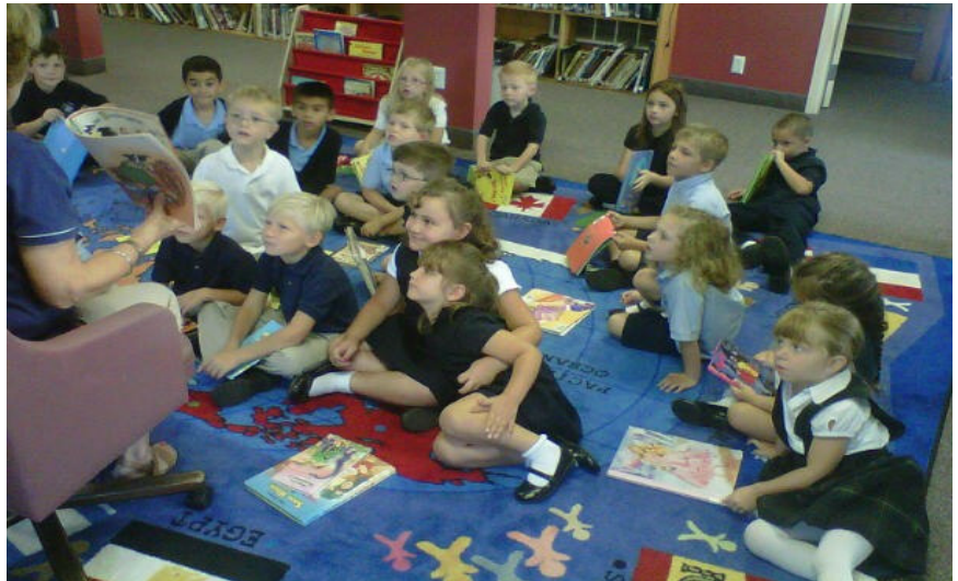
Grades K-2: story time in the library.