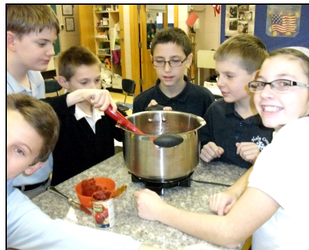
(How many cooks does it take to stir a pot of chili?)