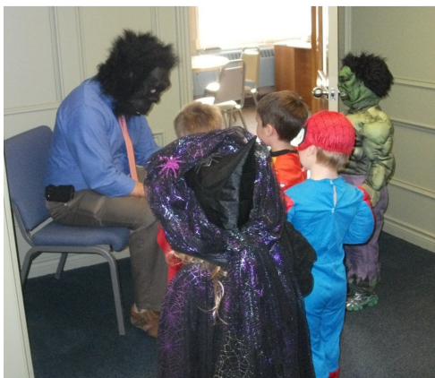
Who (or what ) was that fuzzy creature lurking outside the office???