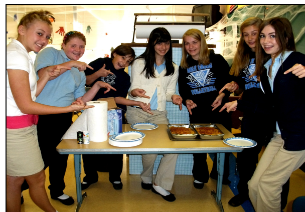
"See? The pumpkin is right there—and there—and there!" the girls report!