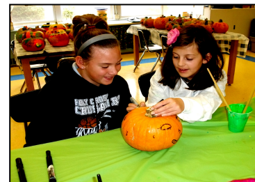
Holy Cross students helped by painting pumpkins for table decorations.

Sunday is Holy Cross’s annual Harvest Festival. The centerpiece of the event is the famous chicken and roast beef dinner (serving from 12:30-6pm, or until they run out). Along with the meal there will be raffles and baked goodies and craft items for sale: all in the activity center. Come!--Have a great meal, enjoy fellowship, and support the parish.