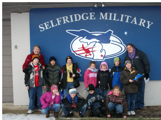
We had a great time at the Selfridge museum!

The base was great and it had a lot of stuff to look at. We think that lots of people would enjoy a visit to the museum.