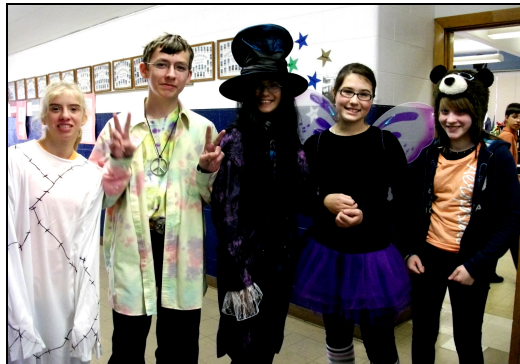
Eighth graders getting into the Hallowe'en "spirit"!