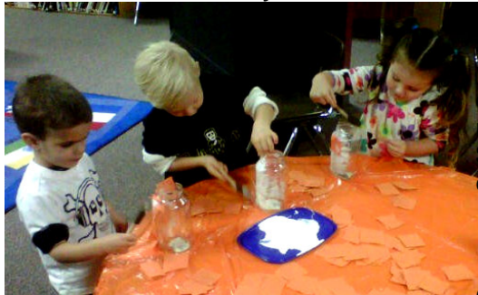
Our preschool friends making "pumpkin jars."