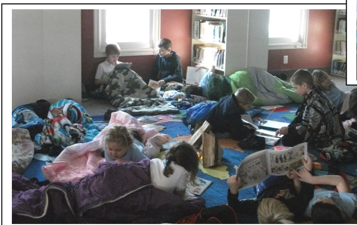
Reading together around the library "campfire."